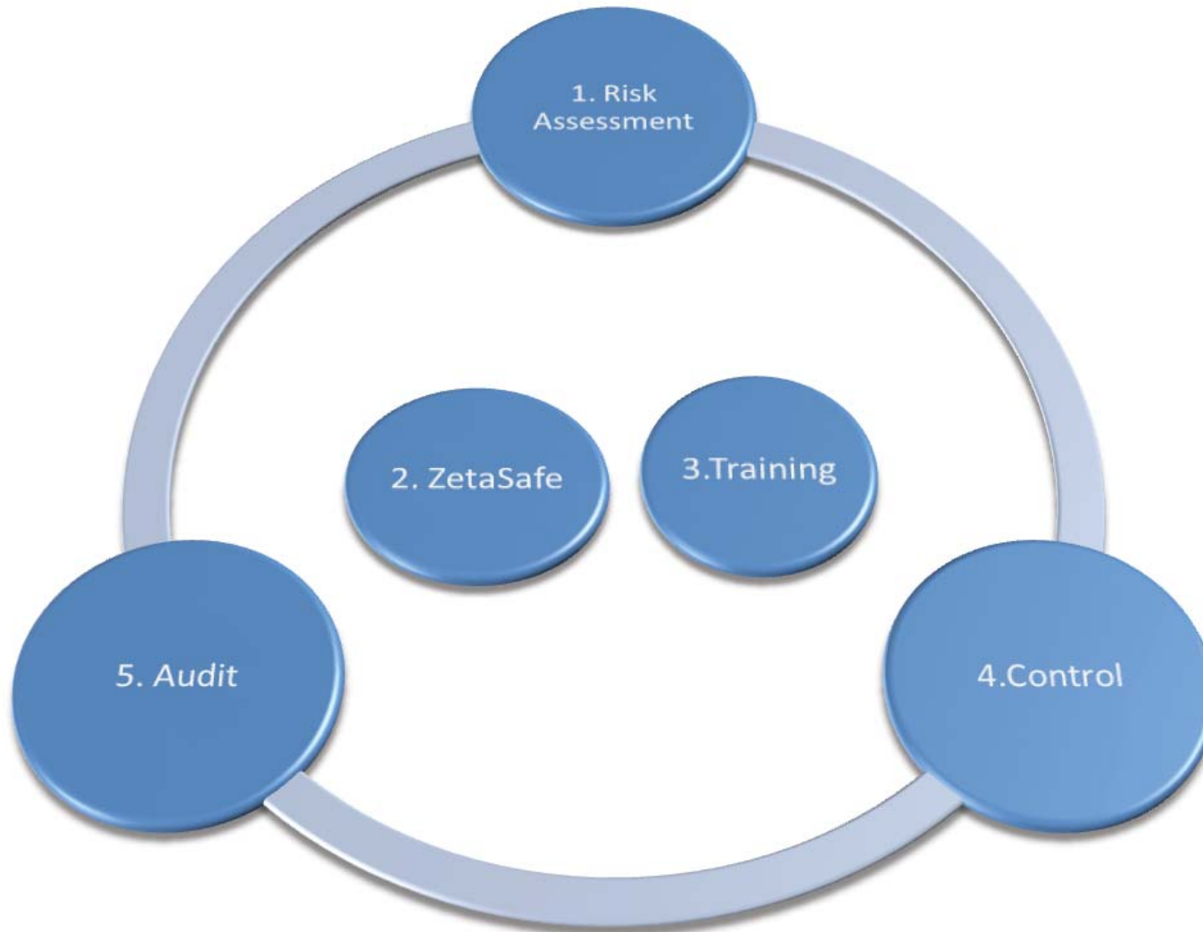
Figure One: Total Risk Management Solution showing the current services offered to our managed pub customers

1) Risk Assessment: Zeta Services carry out the two yearly statutory risk assessments in accordance with HSE ACoP L8